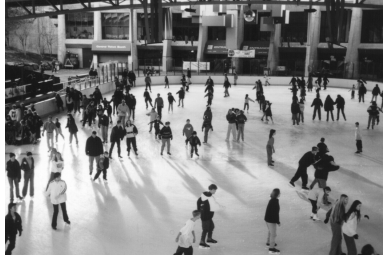
Activities Bring People to Downtown Spokane (Ice Palace)