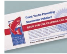
Car wash coupon