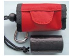
Pet waste dispenser with bags