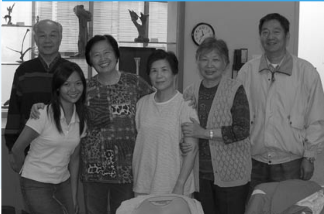
The Chinese Luncheon at the Redmond Senior Center brings friends together.

our community is the RedmondLights month-long celebration of diverse traditions, cultures and faiths, held during the winter holiday season. The event’s attention to diversity actually garnered it a 2002 Program of Excellence award from the Washington Recreation and Parks Association and 2004 Diversity Champion Award from the Association of Washington Cities. RedmondLights’ kickoff and subsequent festivities highlighting culturally diverse food, entertainment and events will be held Sunday, December 4, 4-8 pm at City Hall. Los Santos Reyes Fiesta, one of many special RedmondLights programs, will feature mariachi bands, food and puppetry on January 7, 5 pm at Redmond High School. (See RedmondLights insert.)