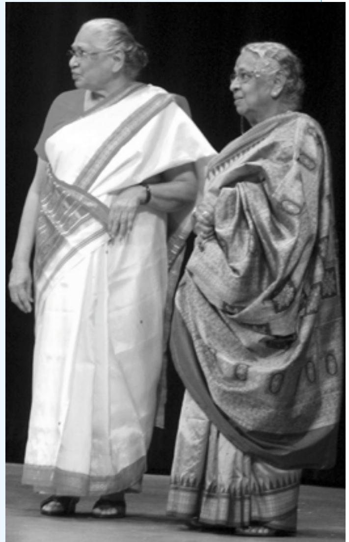
Costumes of India featured at the Redmond Senior Center